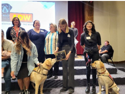
Staff members, along with two of the Assistance Dogs of the West, with their 2024 State Rehabilitation Council Award.

• Outstanding Nonprofit/Provider: Assistance Dogs of the West, Taos. This organization has shown that students can successfully hold a job with the skills they learn in their Pre-Employment Transition Services program.